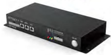
BATTERY ARRAY UNIT