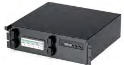
HVCB03 - CONTROLLER BOX